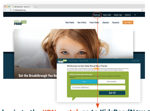
To log in to the KRN portal, go to KidsReadNow.org, then click "Login" at the top of the page, or visit portal.KidsReadNow.org.